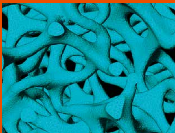
Attention to detail: A finite element mesh of an open-cell foam.

The award-winning University of Exeter spin-out company Simpleware was set up to commercialise a physics-based computer simulation tool. The software is underpinned by patented techniques developed and improved, with the aid of EPSRC funding, to produce a previously unattainable level of realism in 3D computer models used for engineering design and simulation. Originally developed in the biomedical field with the company's first project in partnership with the National Health Service, focusing on improving the understanding of how loads are transmitted in healthy hips, the software has since been successfully adopted in a wide range of healthcare-related projects and across a host of disciplines and industries – from mobile phones to car engines, asphalt damage to back pain and contact lenses to hearing aids. Simpleware has achieved over a 40 per cent annual growth rate with exports contributing 81 per cent of total turnover. Its global markets include the US, EU, China and Canada.